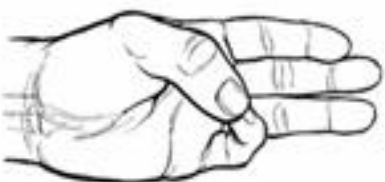
5. Thumb to Finger Touch Finish at Palm Crease