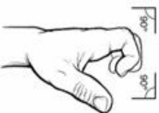
3. Karate Chop (90/90 position)