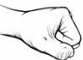
4. Closed Fist