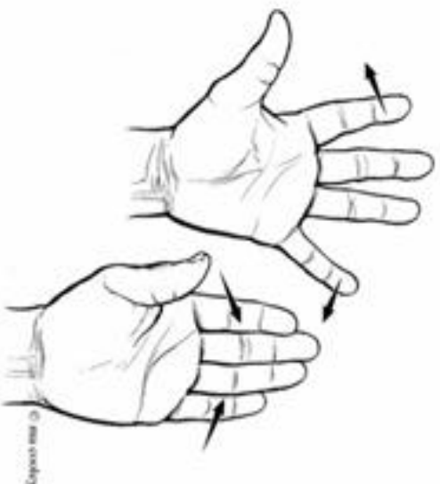
5. Open & Closed Fingers